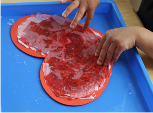
First put glue on plastic The next step is to cover the clear plastic heart with tissue paper. Glue dries overnight. Glue on Heart

shape. Put glue on heart shape place tissue on heart shape then glue on back heart shape and the hook.